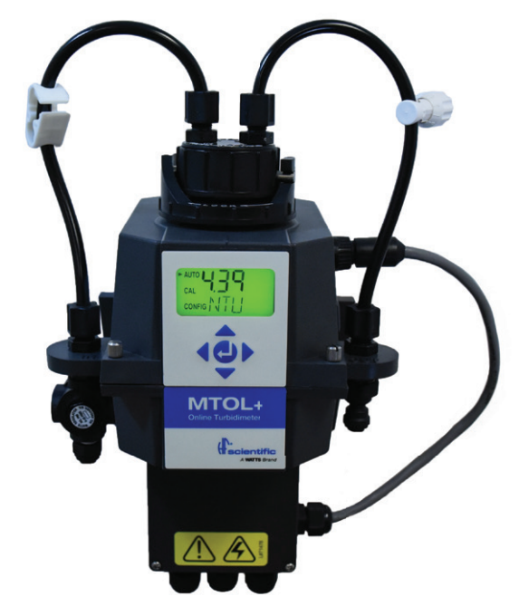
MTOL+ Online Process Turbidimeter Factory default 0 - 100 NTU