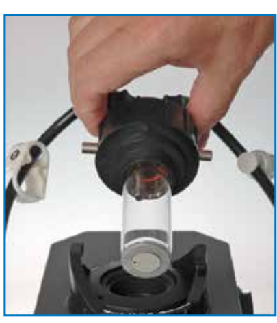
Patented Ultrasonic Autoclean System Keeps the optical chamber clean in finished or raw water applications.

Leading edge microprocessor technology combined with over 35 years of optical measurement expertise has allowed HF scientific to become the leader in regulatory reporting turbidimeters. The MTOL+ Online Process Turbidimeter has been specifically designed to meet regulations of EPA 180.1 and ISO 7027.