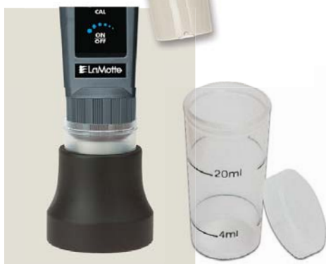
Weighted Stand Code 1746