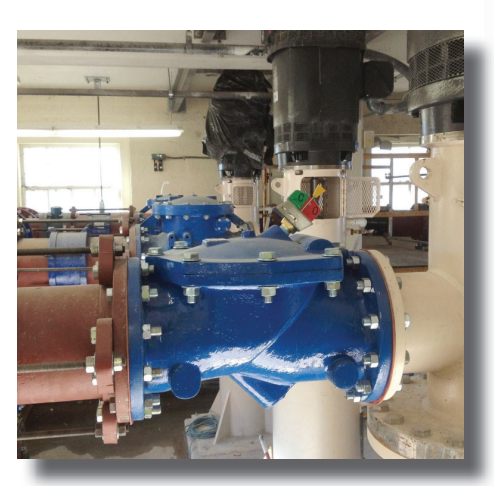
Crystal Springs Pump Station Roanoke, VA